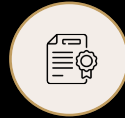
CERTIFICATE OF AUTHENTICITY